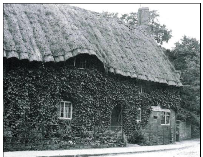
The old Post Office

Women in the village who had time on their hands saw it as their duty to serve others - knitting and sewing for the war effort. No woman should be just sitting, she should be knitting. Even Queen Mary sat knitting. Cardigans, socks, sweaters, mittens, scarves and anything else that could be knitted was produced in enormous amounts. Sewing focussed on clothing for the troops and the sick and wounded in hospitals. In addition women organised fund raising bazaars and fêtes in the summer. Money being sent to the Red Cross. What the war brought was recognition that women were wanted and no longer helpful but essential. Even if they were not wanted on the front line there were increasing opportunities on the Home Front. Nursing, munition work, driving ambulances and